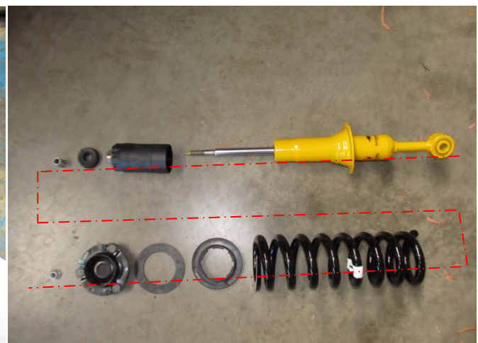
Figure 2: Strut assembly component order