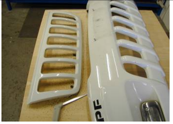
Carefully cut along joining line with a keyhole saw.