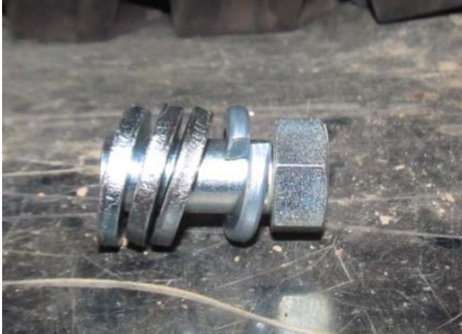
Figure 1: Washers on bearing mount.