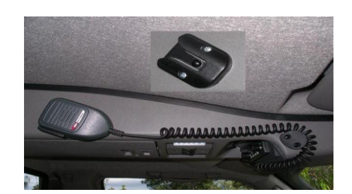
Microphone clip on slight angle